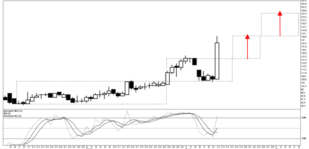
Kinerja saham BHIT

MNC Investama Tbk (BHIT) 13032018 O=107 H=140 L=107 C=135 V=0.308 Chg=+20 (+26.2%)